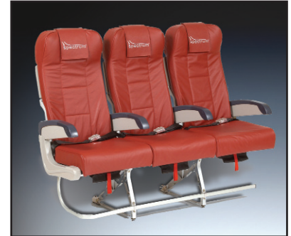
B/E Aerospace thermoforms KYDEX sheet into aircraft seating components such as armrests, food trays, shrouds, footwells, shoe boxes, and container holders.

While B/E provides seats for all classes of air travel, it's best known for premium seating in first class and business class sections. Airlines use the comfort and roominess of premium seating as a passenger inducement and continually promote design improvements. "Our use of KYDEX® sheet, as a result, has grown substantially," says Douglas.