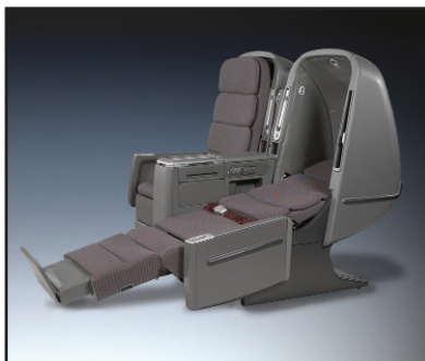
MiniPod seats can be extended so passengers can stretch out and sleep comfortably during long flights. The seat shrouds (which afford privacy) and other seating components are thermoformed of KYDEX® sheet.

KYDEX® T, which B/E uses the most, is a flame-retardant grade (FAR 25.853(a)) that is cost-competitive with flame-retardant ABS and ABS/PVC sheet, but has higher impact strength and extensibility. It is among the most rigid thermoforming materials available, yet is reportedly easy to form with outstanding deep-draw properties and part definition.