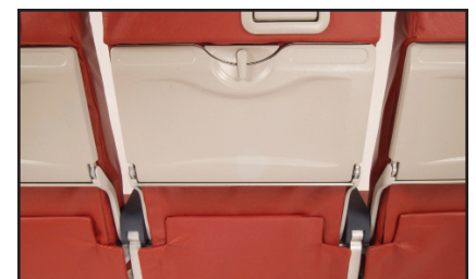
Food trays of KYDEX® sheet are durable as well as aesthetic. They resist cracking and chipping and withstand repeated cleanings with no staining or fading.