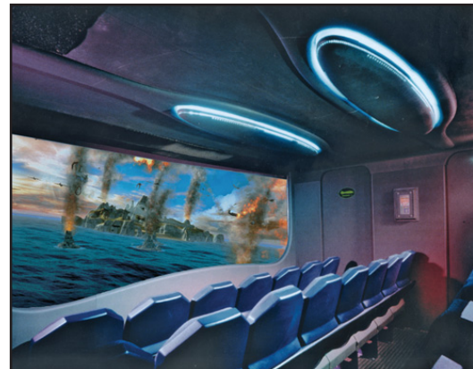
Using electric actuators to pitch, sway, and heave simulators containing from 6 to 40 seats, SimEx is able to immerse audiences into underwater adventures and faraway space flights. Yet, the simulator motion also causes excessive wear and stress to seats and side panels, and requires a high-impact, high-strength material like KYDEX® 100 sheet, a proprietary thermoplastic alloy typically enlisted by the aerospace and transportation industries.

Burbank, CA — Lift off for a voyage to Mars, experience an undersea adventure, or race a volcanic eruption with a pack of dinosaurs. Virtually anything is possible while sitting in one of the motion theatre attractions created by SimEx-Iwerks, Burbank, CA, which not only designs and builds the simulator hardware, but also produces the software and the films used in the theatres. Found around the world at theme parks, casinos, zoos, aquariums, planetariums, science centers, and museums, these simulators, which can hold from 6 to 40 seats in a single cabin, take audiences on thrill rides, pitching, swaying, rolling, and surging with the action on the screen. Of course, with all this motion comes extreme stress for components like seats and wall panels. To handle the stress, SimEx relies on an innovative thermoplastic sheet called KYDEX® 100, which is produced by KYDEX, LLC, Bloomsburg, PA. Designed for high impact and frequently specified for aircraft and mass transit applications, KYDEX® 100 replaced a failing material and saved SimEx and its customers time and money.