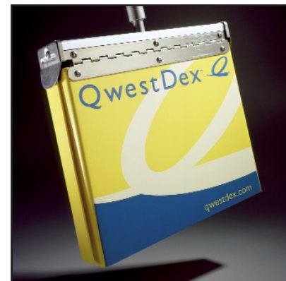
Telephone directory binders of KYDEX® sheet, an aluminum spine, and spring-loaded stainless steel hinges close in clamshell-fashion to minimize effects of weather, vandalism and wear.

A proprietary swing-up holder shields the directories from destruction by encasing them in binders made of thermoformed KYDEX® thermoplastic sheet from Kleerdex Company, LLC. Denver-based Qwest – and telecommunications giant US West, which it acquired in 2000 – have purchased the swing-up directory holders for nearly 20 years from its manufacturer, Benner-Nawman, Inc., headquartered in Wickenburg, AZ.